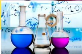
Chemical and bio-chemical